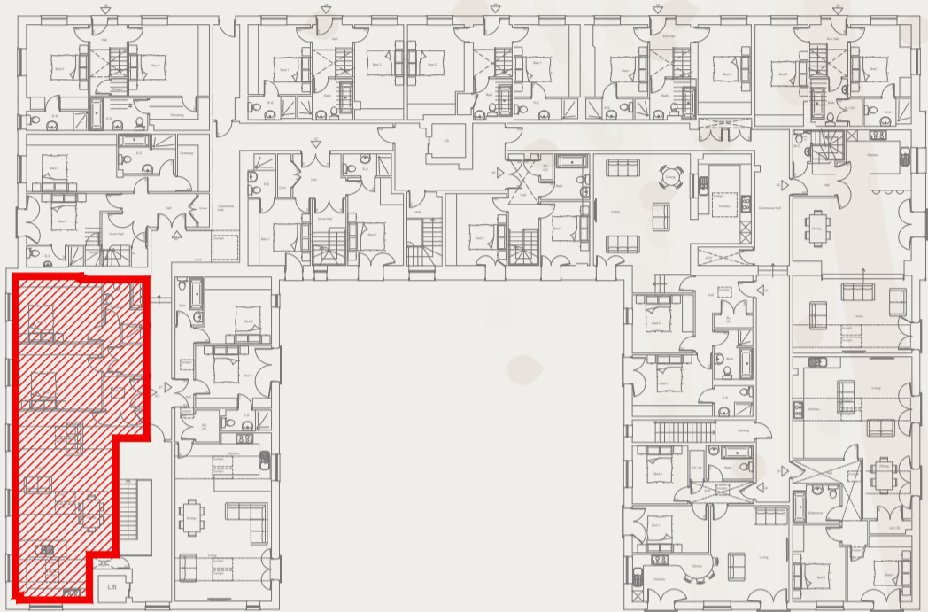
Apartment Entrance Floor Level - First Floor