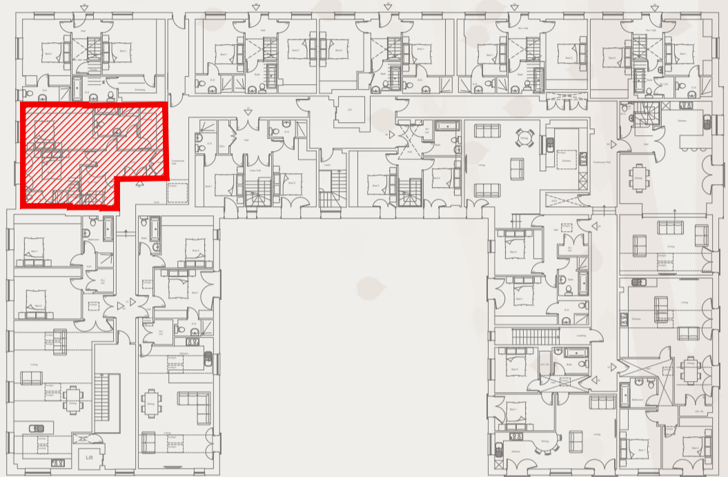
Apartment Entrance Floor Level - First Floor