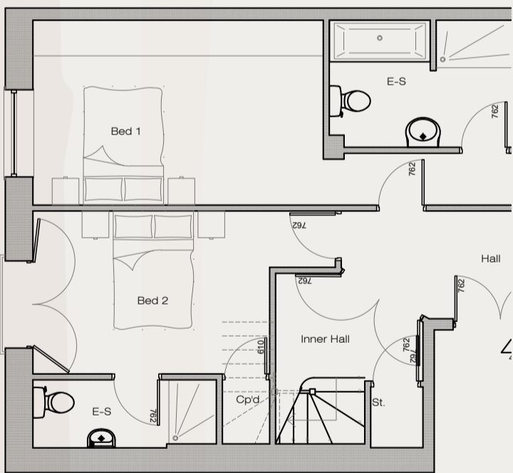
First Floor Level