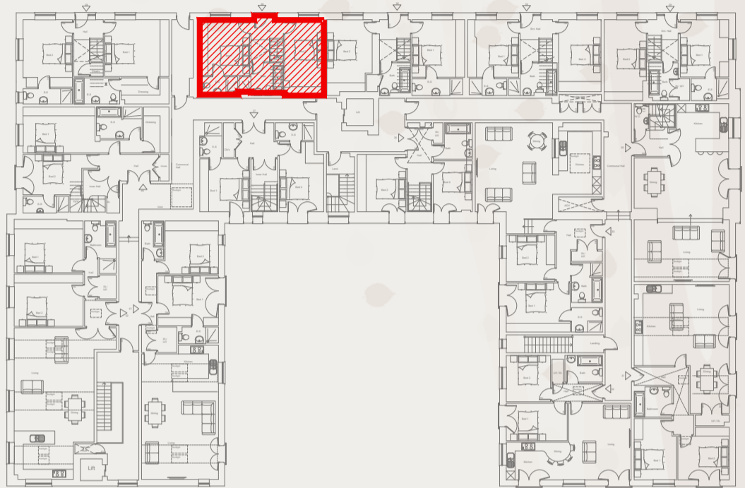
Apartment Entrance Floor Level - First Floor