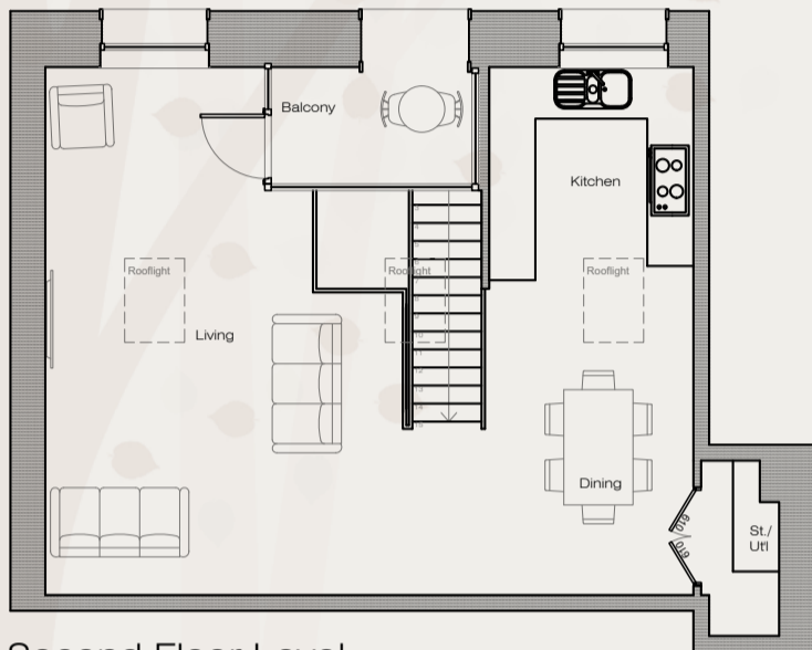
Second Floor Level

All areas include stairs at both upper and lower floor areas, voids and low head height areas. Linear dimensions all given to furthest extremities. All further information is approximate and for guidance purposes only. Any purchasers are to check dimensions prior to any contractual arrangements made. Copyright reserved to WBD. This drawing may not be used or reproduced without prior written consent.