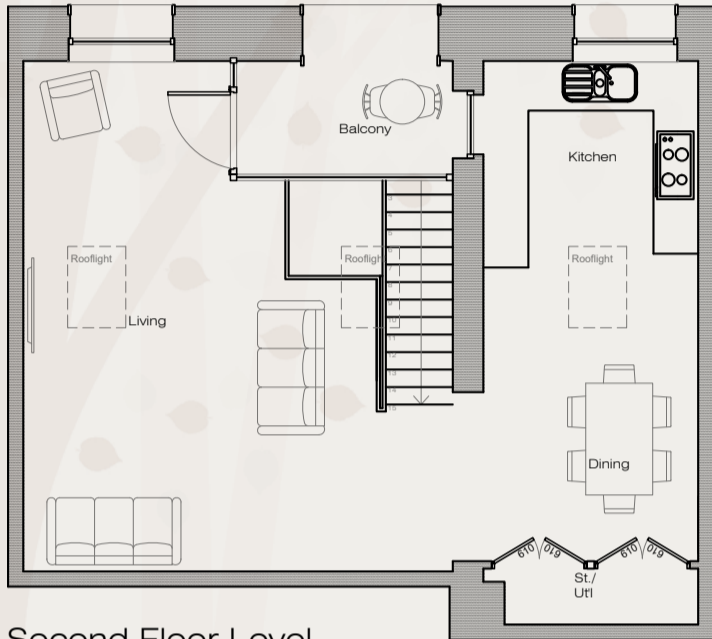
Second Floor Level

All areas include stairs at both upper and lower floor areas, voids and low head height areas. Linear dimensions all given to furthest extremities. All further information is approximate and for guidance purposes only. Any purchasers are to check dimensions prior to any contractual arrangements made. Copyright reserved to WBD. This drawing may not be used or reproduced without prior written consent.