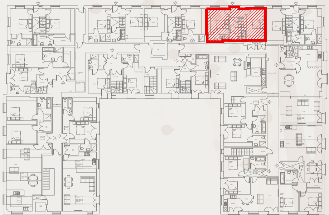
Apartment Entrance Floor Level - First Floor