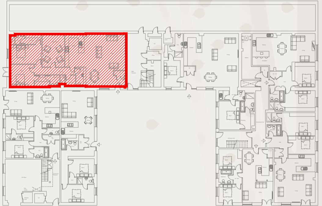
Apartment Entrance Floor Level - Ground Floor