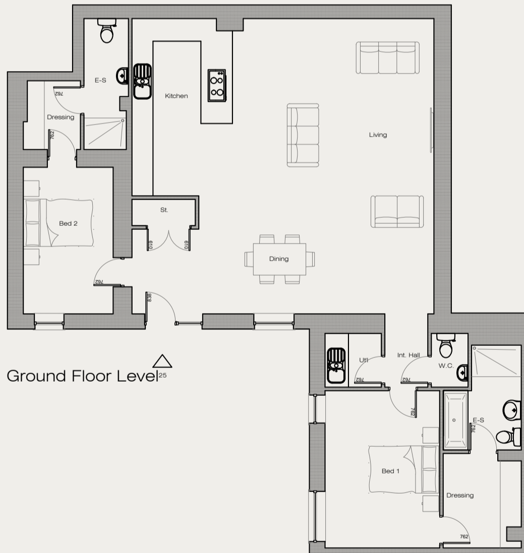
Apartment Entrance Floor Level - Ground Floor