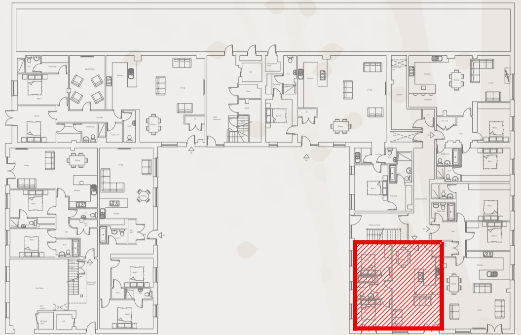
Apartment Entrance Floor Level - Ground Floor