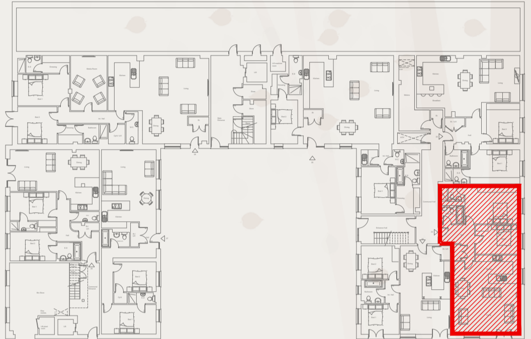
Apartment Entrance Floor Level - Ground Floor

All areas include stairs at both upper and lower floor areas, voids and low head height areas. Linear dimensions all given to furthest extremities. All further information is approximate and for guidance purposes only. Any purchasers are to check dimensions prior to any contractual arrangements made. Copyright reserved to WBD. This drawing may not be used or reproduced without prior written consent.