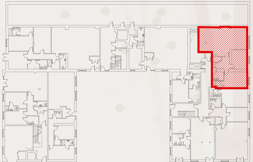
Apartment Entrance Floor Level - Ground Floor