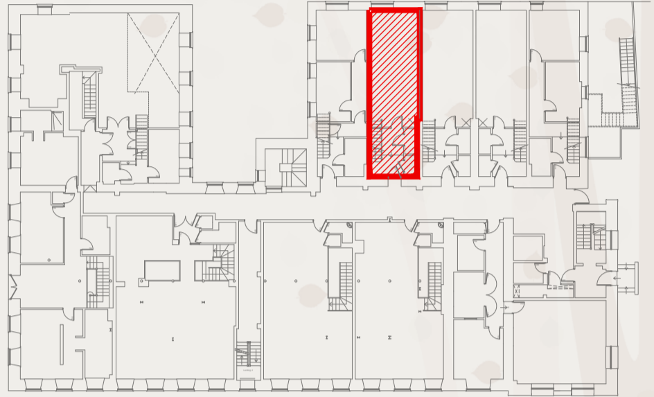
Apartment Entrance Floor Level - Ground Floor

General notes: Do not scale the drawing. This drawing is to be read in conjunction with all relevant drawings and specifications relating to the job whether or not indicated on the drawing. All area include stairs at both upper and lower floor areas, voids and low head height areas. Linear dimensions all given to furthest extremities. All further information is approximate and for guidance purposes only. Any purchasers are to check dimensions prior to any contractual arrangements made. Copyright reserved to WBD. This drawing may not be used or reproduced without prior written consent.